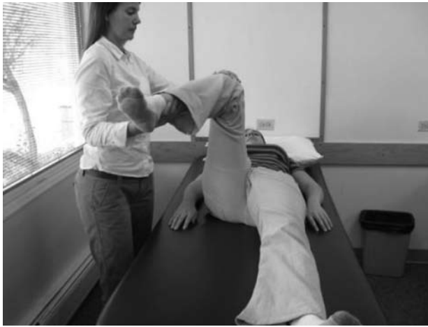
FIGURE 3. Flexion-internal rotation test.