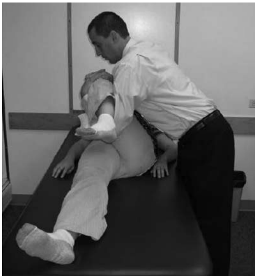
FIGURE 4. Flexion-adduction-axial compression test.

with this maneuver, and as noted above all were confirmed via arthroscopy to have labral tears.