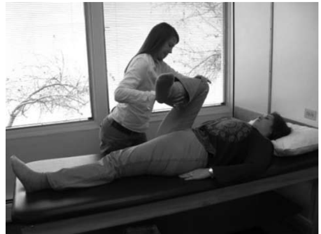
FIGURE 5. (ABOVE LEFT) Palpation posterior to greater trochanter.