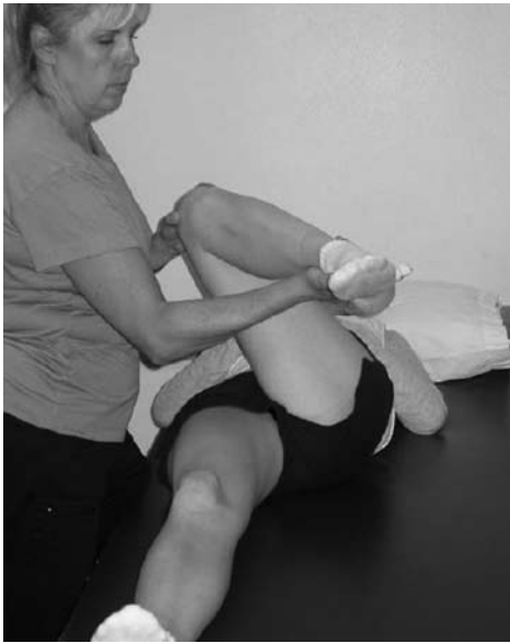
FIGURE 1. (LEFT) Flexion-adduction-internal rotation test.